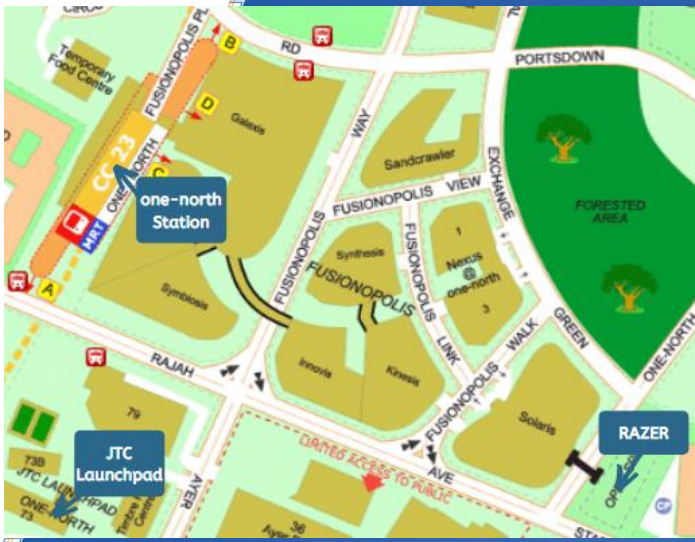
Site Plan: Powered by Streetdirectory.com