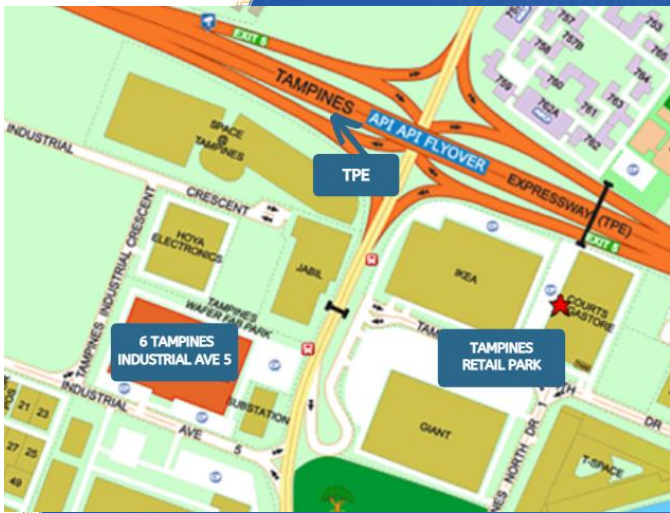
Map powered by Streetdirectory.com