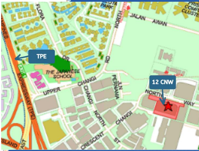
Map powered by Streetdirectory.com