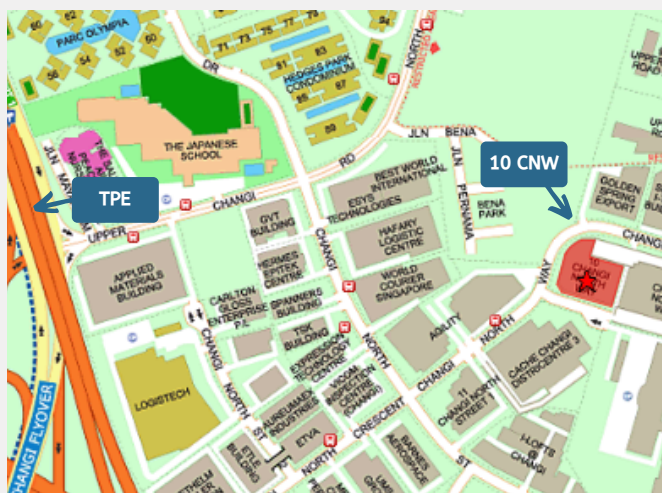
Site Plan: Powered by Streetdirectory.com

Disclaimer: This document is prepared for information only. Boustead Projects Limited makes no guarantee that the information contained herein is accurate or complete.